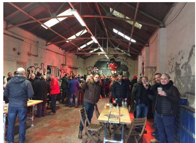
Kro Old Trafford